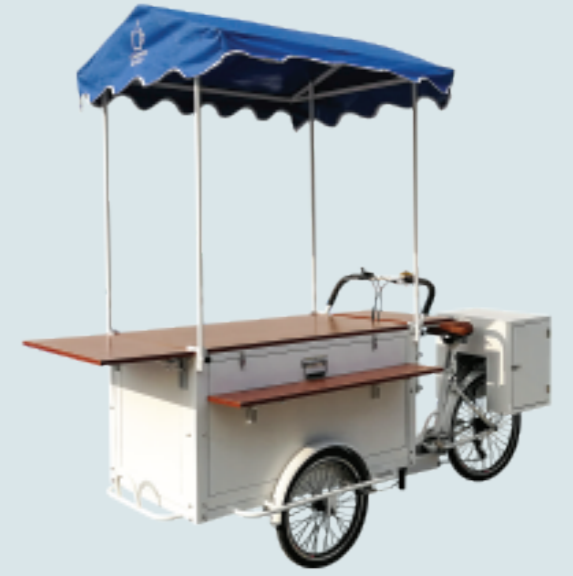
coffee selling bike

Human wheel size: front wheel 20*1.75, rear wheel 24*1.75 Electric wheel size: rear wheel 24*2.125 front wheel 20*2.125 Vehicle size: 2300 * 850 * 2200mm Body configuration: water supply system Hub motor: 250w/350w Electric vehicle configuration: rechargeable lithium battery 36v 12AH (customizable/removable) Aluminum alloy double-layer knife ring Speed: external Shimano 6 speed adjustable Power: manpower/electrical models can be customized Brake: Aluminum alloy V brake Car compartment material: multilayer plywood/cold rolled sheet Frame material: high carbon steel argon arc welding Function: can be customized according to needs, can be equipped with rain canopy