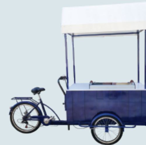
Ice cream takeaway bike

Function: can be customized according to needs, can be equipped with rain canopy