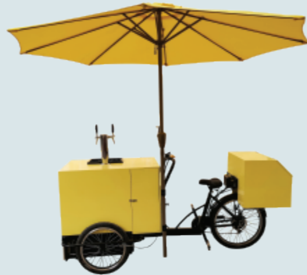
Yellow beer bike

Function: can be customized according to needs, can be equipped with rain canopy