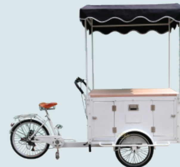
Big coffee bike

Function: can be customized according to needs, can be equipped with rain canopy