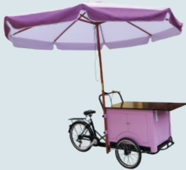
purple coffee bike

Human wheel size: front wheel 20*1.75, rear wheel 24*1.75 Electric wheel size: rear wheel 24*2.125 front wheel 20*2.125 Vehicle size: 2300 * 820 * 1100mm Body configuration: water supply system Hub motor: 250w/350w Electric vehicle configuration: rechargeable lithium battery 36v 12AH (customizable/removable) Aluminum alloy double-layer knife ring Speed: external Shimano 6 speed adjustable Power: manpower/electrical models can be customized Brake: Aluminum alloy V brake Car compartment material: multilayer plywood/cold rolled sheet Frame material: high carbon steel argon arc welding Function: can be customized according to needs, can be equipped with rain canopy