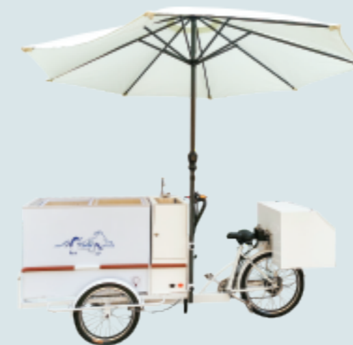
Water supply refrigerator bicycle