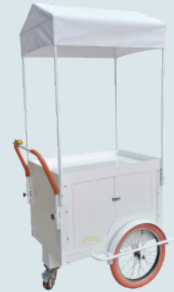
Takeaway cart (Manpower/Electric)

Wheel material: universal wheel Vehicle size: 1100*600*1100mm Power: human cart Car compartment material: multilayer plywood/cold rolled sheet Frame material: high carbon steel argon arc welding Function: can be customized according to needs