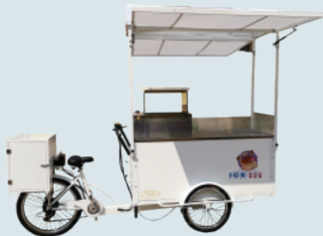
Hot dog fried ice bike