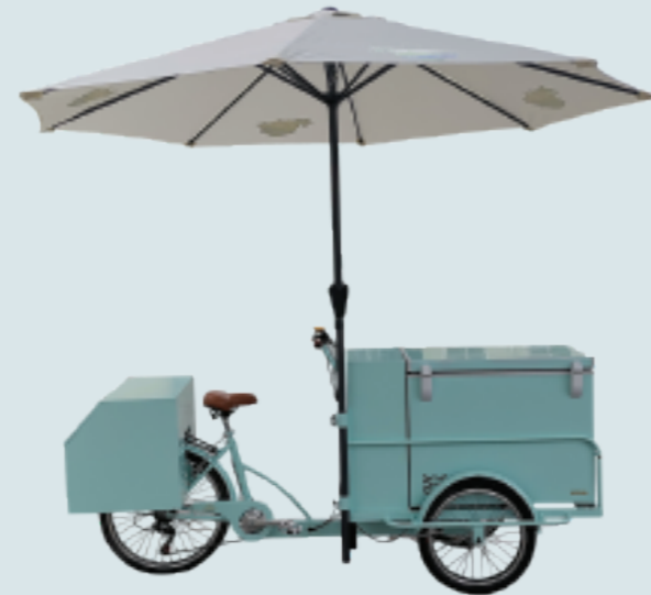
Mint Green Ice Cream Vending Popsicle bike (Manpower/Electric)

Human wheel size: front wheel 20*1.75, rear wheel 24*1.75 Electric wheel size: rear wheel 24*2.125 front wheel 20*2.125 Vehicle size: 2400*950*2200mm Hub motor: 250w/350w Electric vehicle configuration: rechargeable lithium battery 36v 12AH (customizable/removable) Freezer size: 1m long Temperature range: 8° — -18° Supply battery: 12v/80AH (refrigerate for 12 hours and freeze for 6 hours) Two power supply modes of 220v/12v can be realized) Aluminum alloy double-layer knife ring speed: 6-speed external Shimano adjustable Power: manpower/electric models can be customized Brake: Aluminum alloy V brake Car compartment material: multilayer plywood/cold rolled sheet Frame material: high carbon steel argon arc welding Function: can be customized according to needs, can be equipped with rain canopy