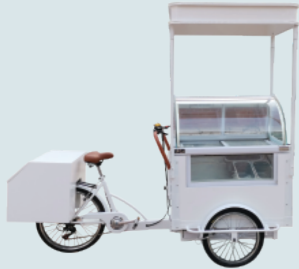
Ice cream vending Popsicle bike (Manpower/Electric)

Human wheel size: front wheel 20*1.75, rear wheel 24*1.75 Electric wheel size: rear wheel 24*2.125 front wheel 20*2.125 Vehicle size: 2400*950*2200mm Hub motor: 250w/350w Electric vehicle configuration: rechargeable lithium battery 36v 12AH (customizable/removable) Freezer size: 1m long Temperature range: 8° — -18° Supply battery: 12v/80AH (refrigerate for 12 hours and freeze for 6 hours) Two power supply modes of 220v/12v can be realized) Aluminum alloy double-layer knife ring speed: 6-speed external Shimano adjustable Power: manpower/electric models can be customized Brake: Aluminum alloy V brake Car compartment material: multilayer plywood/cold rolled sheet Frame material: high carbon steel argon arc welding Function: can be customized according to needs, can be equipped with rain canopy