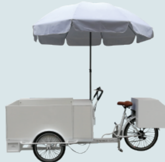
Custom refrigerator Popsicle bike (Manpower/Electric)

Human wheel size: front wheel 20*1.75, rear wheel 24*1.75 Electric wheel size: rear wheel 24*2.125 front wheel 20*2.125 Vehicle size: 2300*850*2200mm Hub motor: 250w/350w Electric vehicle configuration: rechargeable lithium battery 36v 12AH (customizable/removable) Freezer: 120L 12/24v DC freezer Temperature range: 8° — -18° Supply battery: 12v/80AH (refrigerate for 12 hours and freeze for 6 hours) Two power supply modes of 220v/12v can be realized Aluminum alloy double-layer knife ring speed: 6-speed external Shimano adjustable Power: manpower/electric models can be customized Brake: Aluminum alloy V brake Car compartment material: multilayer plywood/cold rolled sheet Frame material: high carbon steel argon arc welding Function: can be customized according to needs, can be equipped with rain canopy