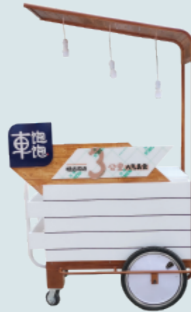
Cake cart (Manpower/Electric)

Wheel material: universal wheel Vehicle size: 1100*600*1100mm Power: human cart Car compartment material: multilayer plywood/cold rolled sheet Frame material: high carbon steel argon arc welding Function: can be customized according to needs