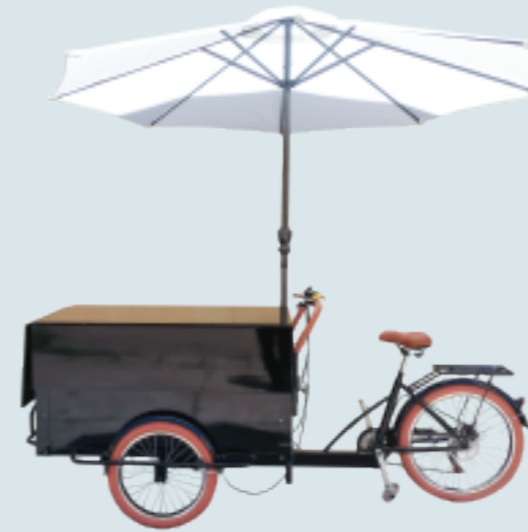
folding coffee bike

Human wheel size: front wheel 20*1.75, rear wheel 24*1.75 Electric wheel size: rear wheel 24*2.125 front wheel 20*2.125 Vehicle size: 2200 * 860 * 1100mm Body configuration: water supply system Hub motor: 250w/350w Electric vehicle configuration: rechargeable lithium battery 36v 12AH (customizable/removable) Aluminum alloy double-layer knife ring Speed: external Shimano 6 speed adjustable Power: manpower/electrical models can be customized Brake: Aluminum alloy V brake Car compartment material: multilayer plywood/cold rolled sheet Frame material: high carbon steel argon arc welding Function: can be customized according to needs, can be equipped with rain canopy