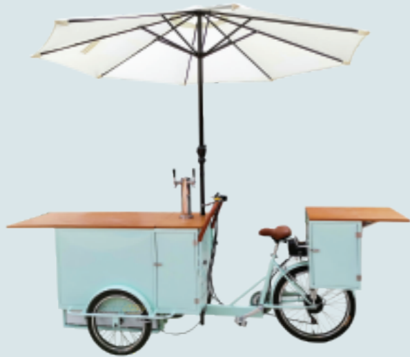
Mint green beer bike