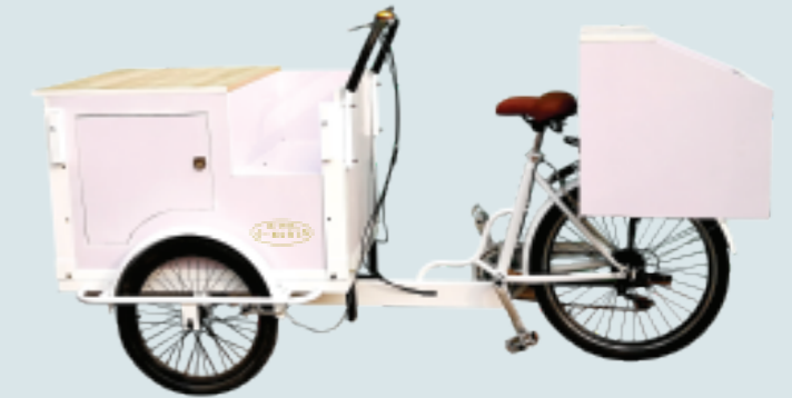
Ice cream Popsicle bike (putting ice cream machine) (Manpower/Electric)

Human wheel size: front wheel 20*1.75, rear wheel 24*1.75 Electric wheel size: rear wheel 24*2.125 front wheel 20*2.125 Vehicle size: 2300*960*1100mm Hub motor: 250w/350w Electric vehicle configuration: rechargeable lithium battery 36v 12AH (customizable/removable) Aluminum alloy double-layer knife ring speed: 6-speed external Shimano adjustable Power: manpower/electric models can be customized Brake: Aluminum alloy V brake Car compartment material: multilayer plywood/cold rolled sheet Frame material: high carbon steel argon arc welding Function: can be customized according to needs, can be equipped with rain canopy