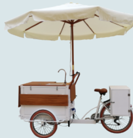
White small coffee bike

Function: can be customized according to needs