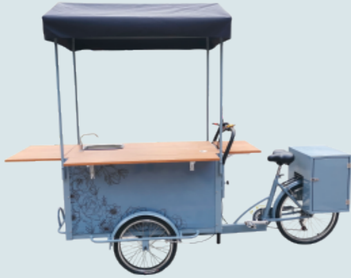
Grey coffee bike