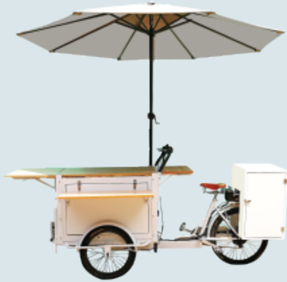
Small coffee bike