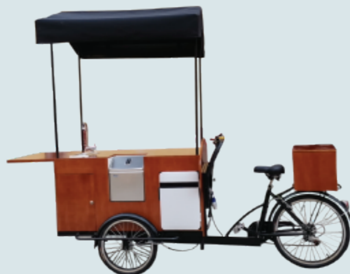
Wood color coffee bike

Function: can be customized according to needs