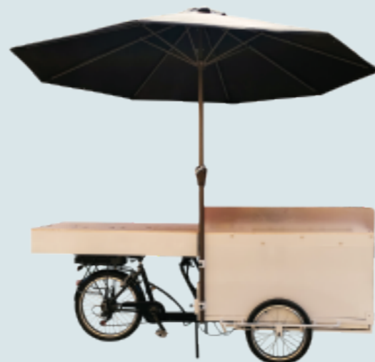
Flip refrigerated food bike

Human wheel size: front wheel 20*1.75, rear wheel 24*1.75 Electric wheel size: rear wheel 24*2.125 front wheel 20*2.125 Vehicle size: 2700*870*2300mm Body configuration: hot dog machine, frying ice machine Hub motor: 250w/350w Electric vehicle configuration: rechargeable lithium battery 36v 12AH (customizable/removable) Aluminum alloy double-layer knife ring Speed: external Shimano 6 speed adjustable Power: manpower/electrical models can be customized Brake: Aluminum alloy V brake Car compartment material: multilayer plywood/cold rolled sheet Frame material: high carbon steel argon arc welding Function: can be customized according to needs, can be equipped with rain canopy