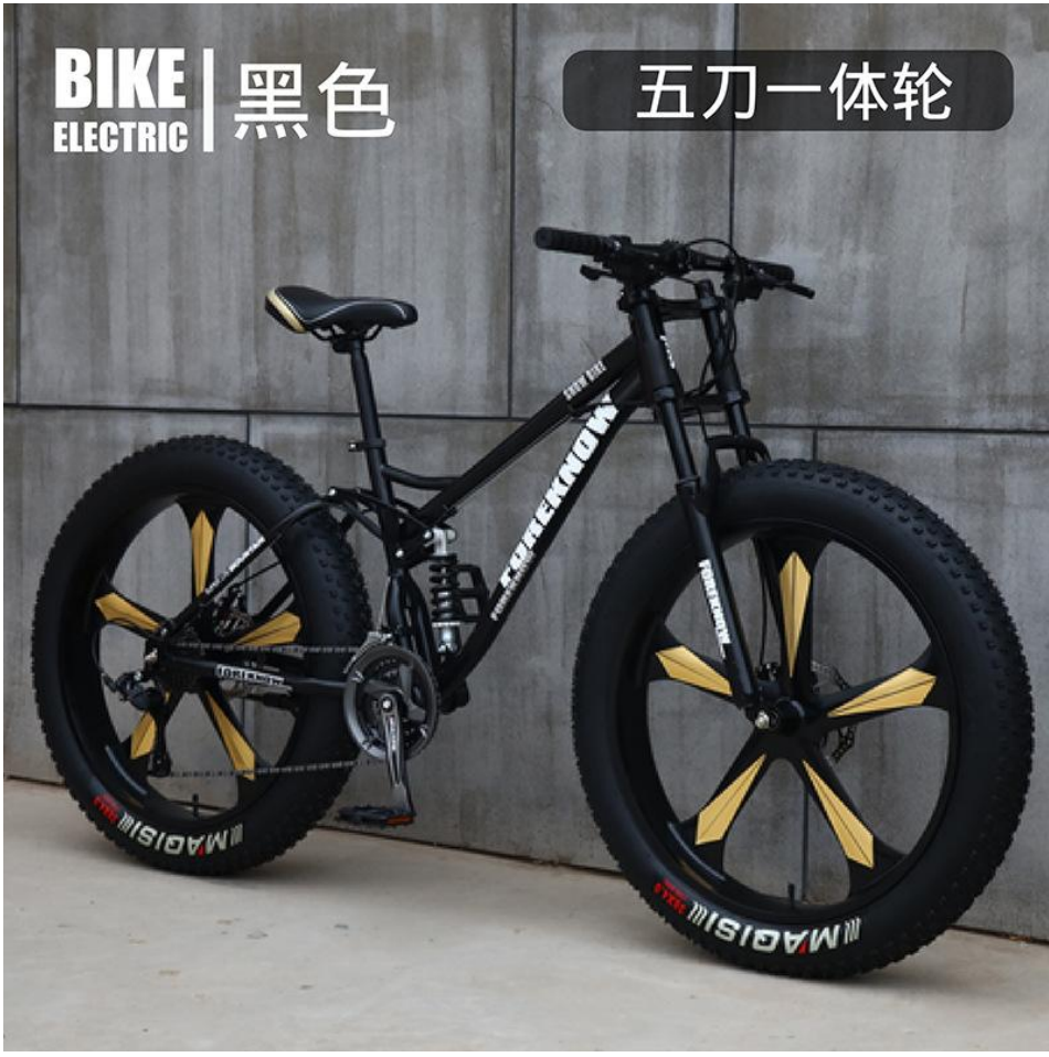
High Carbon Frame, Shockproof,24 inch/26 Inch Size Choice, 7/21/30 speeds for selection and 2 tire types